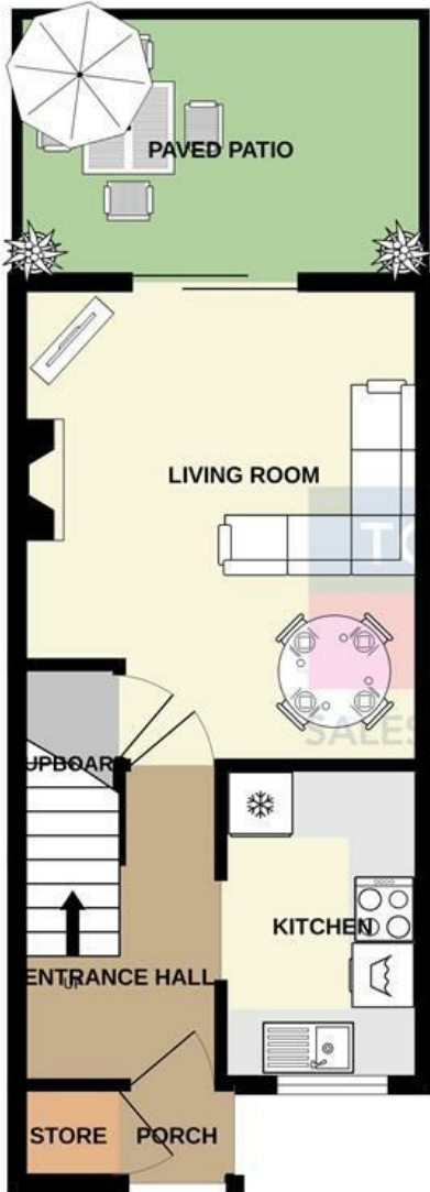
GROUND FLOOR 307 sq.ft. (28.5 sq.m.) approx.