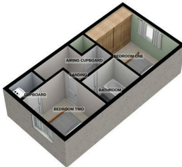
TOTAL FLOOR AREA : 599 sq.ft. (55.7 sq.m.) approx.

For illustrative purposes only. Decorative finishes, fixtures, fittings and furnishings do not represent the current state of the property. Measurements are approximate. Not to scale. Made with Metropix © 2023